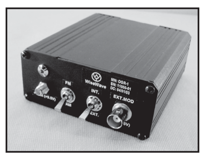
OGR & OMR Series