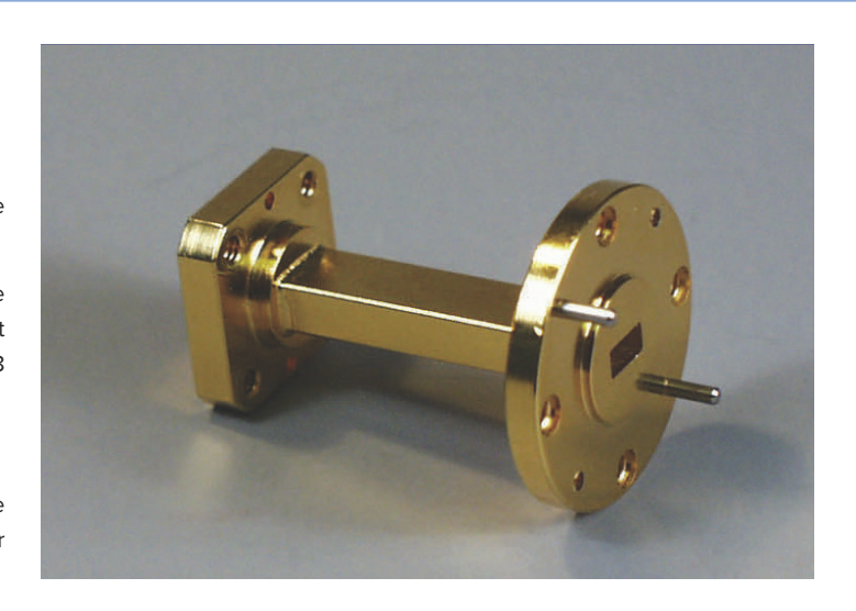
Custom flanges available

The 688 Series Flange adapters are used in operational millimeter wave transmission systems that require a transition between components or systems with different flanges.