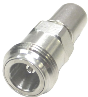
Type N Female for CNT-400 braided cable