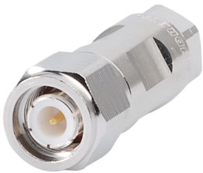
TNC Male for 1/4 in FSJ1-50A cable