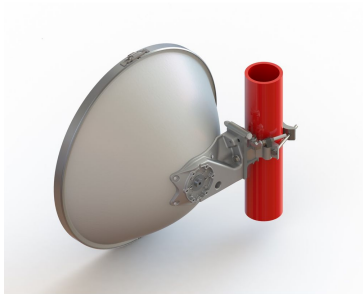
0.6 m | 2 ft ValuLine® High Performance Low Profile Antenna, single-polarized, 12.700–13.250 GHz