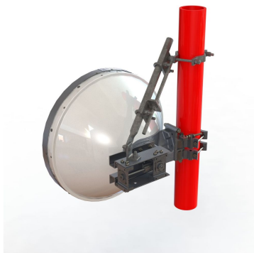
0.6 m | 2 ft ValuLine® High Performance Low Profile Antenna, dual band, single polarised 71.000 – 86.000 GHz