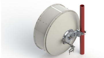
1.2 m | 4 ft ValuLine® High Performance Low Profile Antenna, single-polarized, 14.400–15.350 GHz